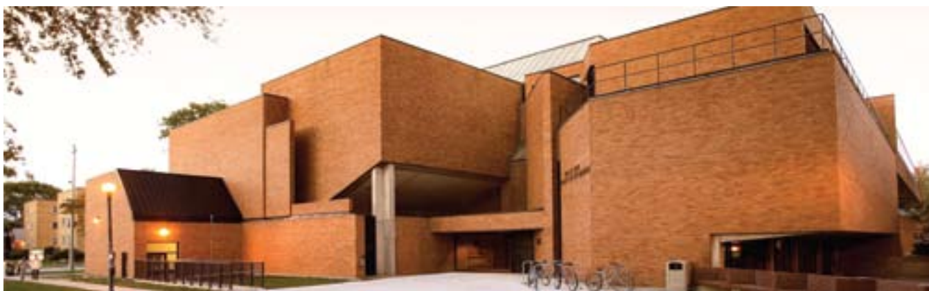
As Windsor Law approaches its 40th anniversary in 2008, alumni contributions have created a modern learning environment and eco-conscious enhancements.