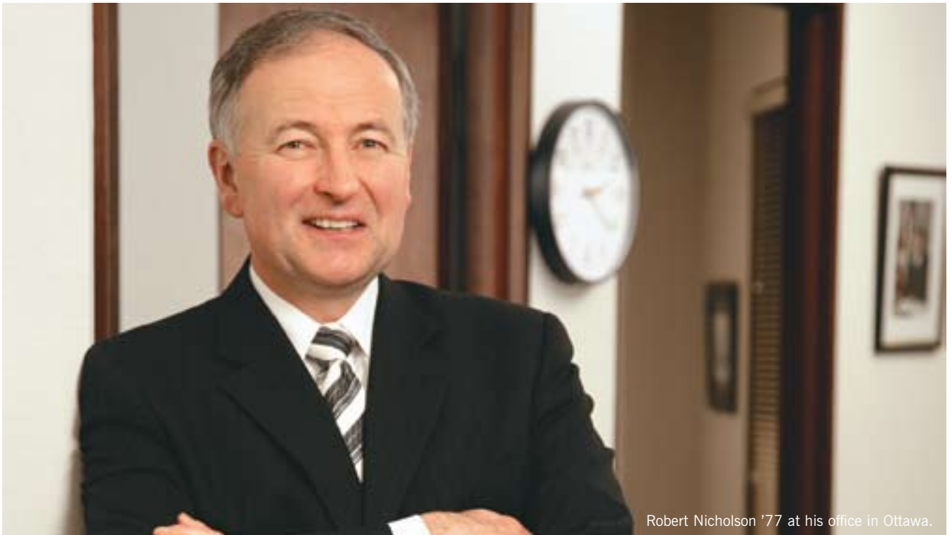
Robert Nicholson '77 at his office in Ottawa.

Windsor Law is proud to count Rob Nicholson '77 among its alumni ranks. Sent to Ottawa as the Member of Parliament for Niagara Falls, he was appointed Leader of the Government in the House of Commons and Minister for Democratic Reform in February 2006. His impressive resume includes a successful law practice in Niagara Falls, where he was born and raised. He was first elected to Parliament in 1984 and was re-elected in 1998, 2004 and 2006. He has served as Critic for Parliamentary Affairs and for Transport and was a member of the Standing Committee on Transport. He has significant federal experience, illustrated by his appointments as Minister for Science and Minister responsible for Small Business in the Kim Campbell government. As well, he was Parliamentary Secretary to the Leader of the Government in the House of Commons from 1989 to 1990 and Parliamentary Secretary to the Attorney General from 1989 to 1993.