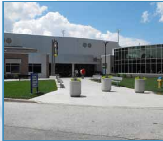
Entrance to the St. Denis Centre