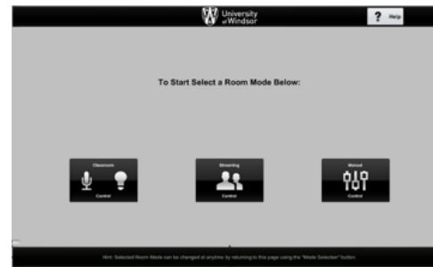
Fig.1 Select Room Mode

Call 519-253-3000 ext. 3051 for help or if cables are missing