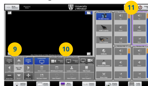
Fig. 4 Streaming Control