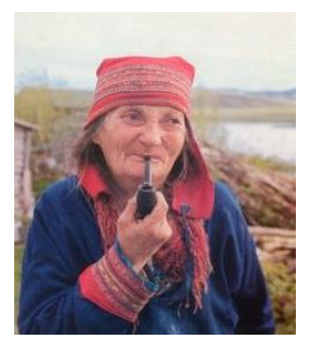
Samiland (Northern Europe)