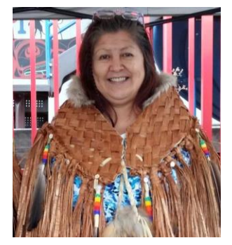
Turtle Island (North America/Canada)

Indigenous peoples are widespread across the globe. In this course we will consider the experiences and writings of Indigenous women from various Lands and regions: