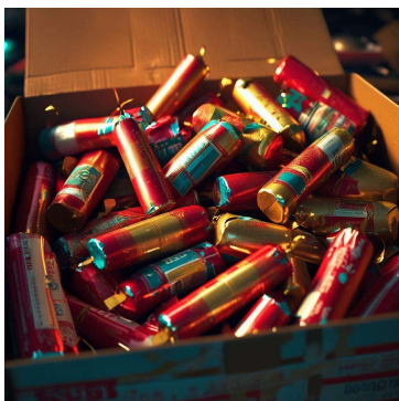
Fireworks or Pyrotechnics