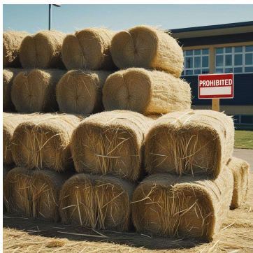
Bales of hay or straw