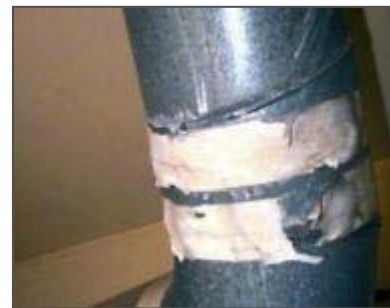
Paper on Seams of Duct