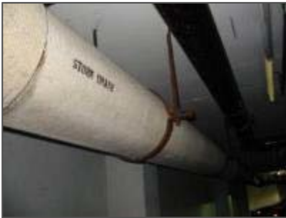
Transite Drain Pipe