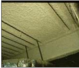
Cementitious Sprayed Fireproofing

application gun. These products may contain up to 90% asbestos and any of the three major types (chrysotile, amosite or crocidolite). Cementitious products were trowelled or sprayed as a wet slurry. These were harder products that did not contain more than 25% asbestos. Only chrysotile asbestos was used in the cementitious type materials.