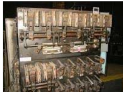
Transite Blocks in Elevator Switchgear