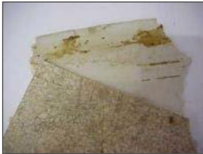
Vinyl Sheet Flooring with Paper Underpad