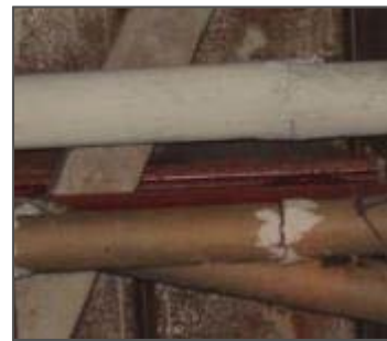
Parging Cement on Sweatwrap and Aircell