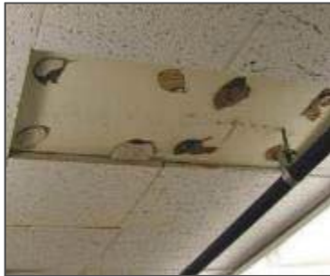
Glued on (Laminated) Ceiling Tiles

Acoustic tile, particularly if splined or glued on, can become friable or release dust when removed. They are usually considered non-friable as they are normally handled intact.