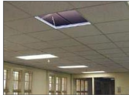
Lay-in Ceiling Tile