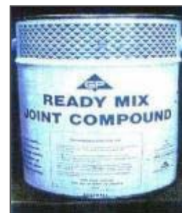
Drywall Joint Compound 1963-1965