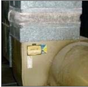
Textile Vibration Damper/Duct Connector