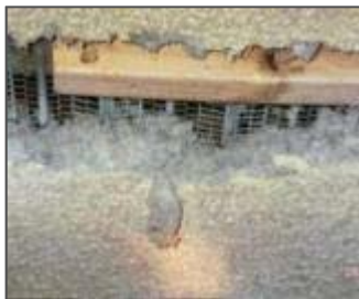
Sprayed Limpet Texture Ceiling on Lath

The use of asbestos was widespread in trowelled or sprayed texture coats, stipple coats and acoustic plasters from the 1950's to the late 1970's (at least as late as 1980). These products always contain less than 25% chrysotile. Some of the harder stipple coats may be considered non-friable in place and only become friable when disturbed by construction or demolition. Other products in this group can be very soft and extremely friable.