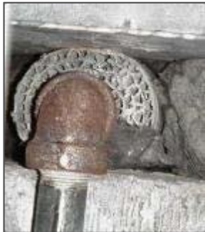
Aircell Insulation (corrugated paper)

It is possible to find all asbestos types in mechanical insulation although chrysotile is predominant and amosite the next most common.