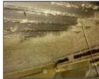
Fibrous Sprayed Fireproofing (beam only)