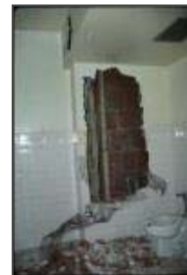
Plaster on Speed Tile