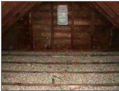
Vermiculite Attic Insulation

Vermiculite has been and continues to be used in a variety of building materials. It was made into a variety of insulation products, was used as a loose fill insulation inside masonry block walls (the largest volume use), stove pipe and stack insulation, fire separations, cold rooms and in walls and attics of buildings, mostly homes. It is important to understand not all vermiculite contains asbestos.