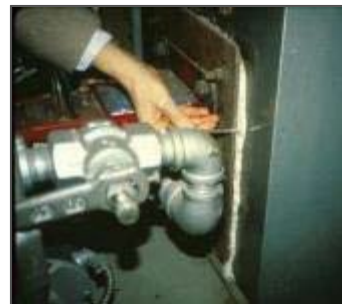
Roper Gasket at Boiler Plate