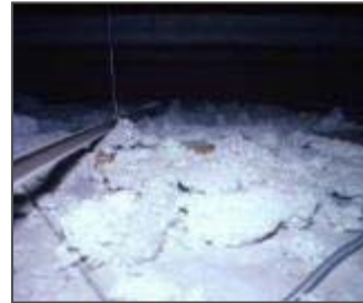
Debris from Fireproofing on Top of Ceiling