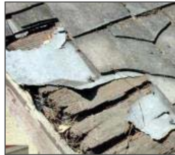
Building Paper Under Roof Tiles