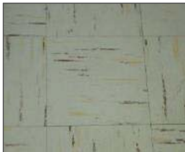
Vinyl Asbestos Tile

Asbestos has been used as a reinforcing agent in a wide range of asbestos/polymer composites. Applications include, floor tiles, engine housings, bins and containers, and a variety of coatings, adhesives, caulks, sealants, and patching compounds. Two areas dominated asbestos use in plastics: phenolic moulding compounds and vinyl-asbestos tile. Few of these products remain in production.