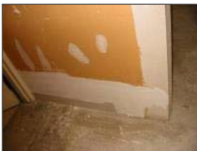
Drywall Joint Compound on Drywall

Drywall joint compound also contained asbestos until the early 1980's. The concentration is quite low (near or less than 5%; always chrysotile). The product in place is quite hard and is normally treated as non-friable.