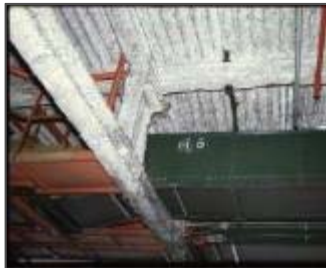
Fibrous Sprayed Fireproofing