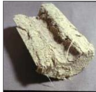
Caposite Block Insulation