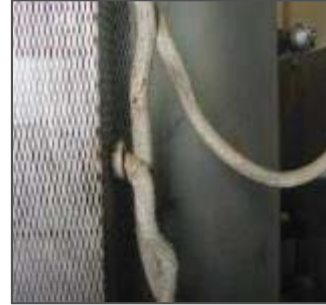
High Voltage Cable Insulation