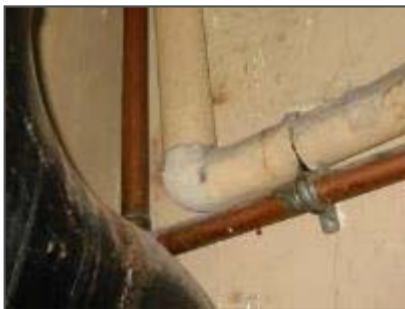
Parging Cement on Pipe Fitting