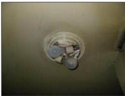
Paper Heat Shield on Incandescent Fixture

Asbestos paper products have been used in a wide variety of applications. Among the most important in construction are roofing felt, gaskets, pipe wrap, as building paper under roof tiles and wood flooring, tape at joints on ducts and duct insulation, as a finishing layer over fibreglass pipe insulation, as heat shields in incandescent light fixtures, as an underpad beneath vinyl sheet flooring, millboard and electrical insulation. Some of these applications are discussed under the headings "Insulation" and "Gaskets and Packings".