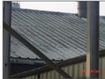
Corrugated Transite Siding/Roofing