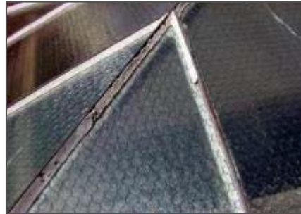
Caulking at Glazing