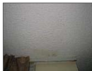
Texture Coat Ceiling