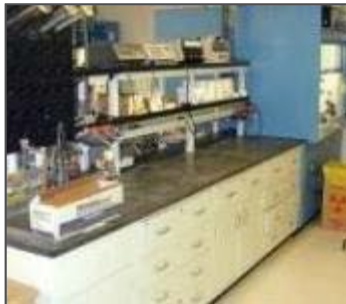
Laboratory Bench Countertop