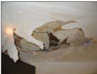
Plaster on Wood Lath

Plaster is non-friable in place but removal is impossible without causing it to become friable. This is significantly different than lay-in acoustic tiles or transite boards which can be removed intact.