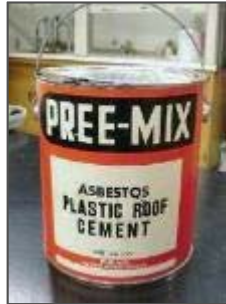
Asbestos Roof Cement

Asbestos has been used in roof coatings and cement and, to a lesser extent, in sealants and caulks. Roof coatings consist of asphalt liquefied with solvents and asbestos fibre filler. Roof cements are similar, but are formulated to a thicker consistency so that they can be used to seal openings through which a liquid coating would flow. Some of these are still in production.