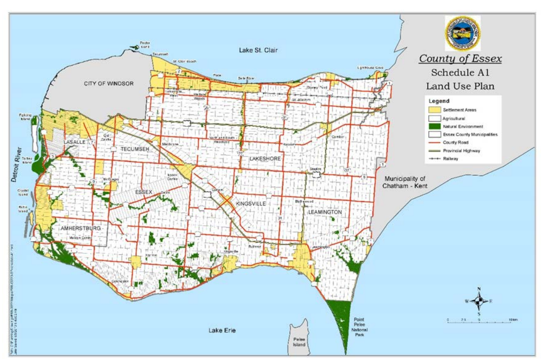
Figure 2. Land Use Plan for the County of Essex (Countyofessex.ca, 2019).