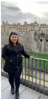
Student Representative of Section 37