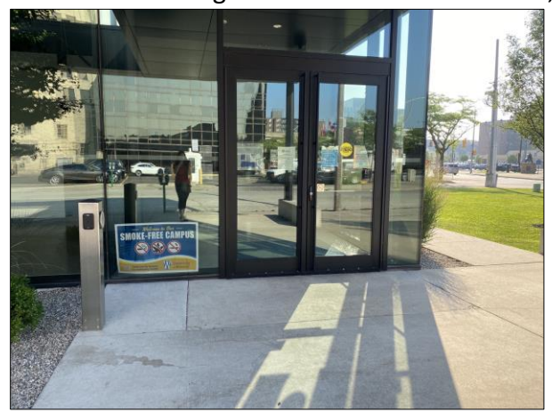
3 AWCCA southwest entrance.

There is an additional entrance also located on the west side, facing Freedom Way, at the south end of the building. These doors are accessible, equipped with actuators and at ground level.