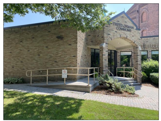
3 Freed Orman Commons' main entrance is equipped with a ramp and automatic door openers.

Freed Orman Commons is connected to Assumption Hall to the northeast. The main entrance is accessible with a ramp and automatic door openers. The hall is all on one level. There is a multiuser, accessible men's and women's washrooms located to the left of the main entrance.