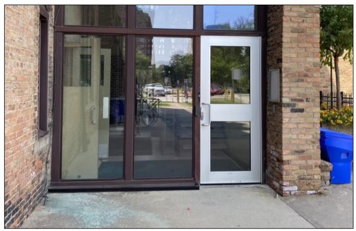
2 East entrance to Assumption Hall. Ground level but no actuators.

There is an entrance on the east side of the parking lot. This is ground level but not equipped with actuators.