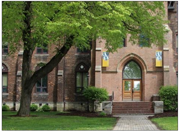
Assumption Hall facing Huron Church Road.