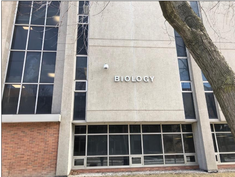
Exterior of the Biology Building.