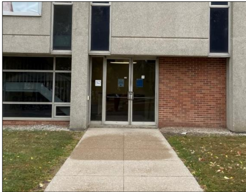
Exterior view of south entrance.