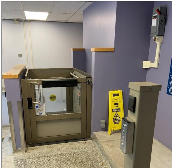
Accessible lift inside the main entrance with access to the lower level.

Report problems with this lift to Facility Services, 519-253-3000 ext. 2850