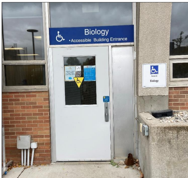
Exterior view of accessible entrance on east side.