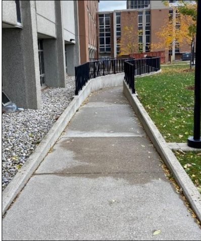
Entrance to ramp leading to east accessible entrance.