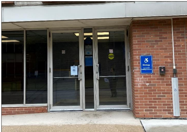
Exterior of the main accessible entrance of Biology Building.

Located on the west side of the building, the main entrance is accessible with actuators to the right of the entrance. Upon entering there is an accessible lift that takes users to the lower level for access to the elevator.