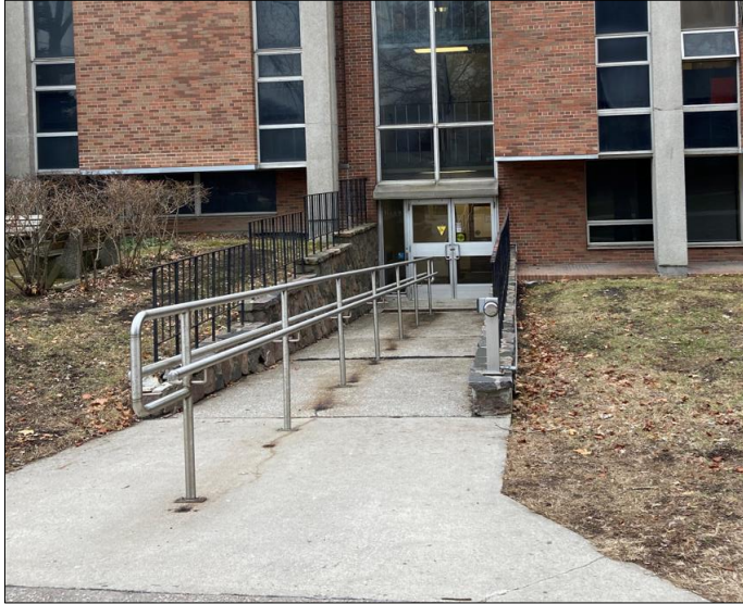
Ramp and doors to the accessible entrance to CHN

An accessible entrance is located on the north side of the building. This entrance is equipped with a ramp and an actuator. This entry point leads to the lower level. Note: the entire lower level and the second level of Chrysler Hall North (CHN), Chrysler Hall Tower (CHT), and Chrysler Hall South (CHS) are connected.