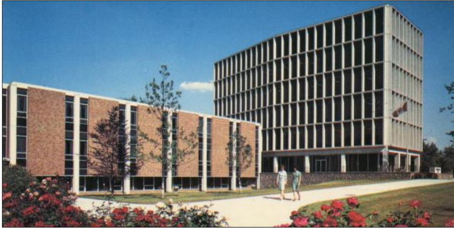
Exterior of Chrysler Hall North (CHN)