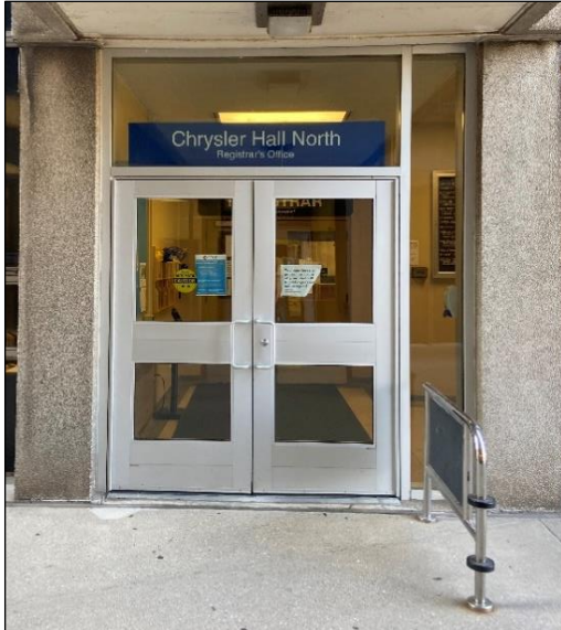
Exterior of entrance to Chrysler Hall North leading directly to Registrar's Office

There is an accessible entrance located on the south side of CHN, directly across from the CHT which leads to the Registrar’s office. Use a ramp on the east or west side of CHT to access this entrance. Please note, that if not accessing the Registrar’s Office, this entrance leads to stairs.