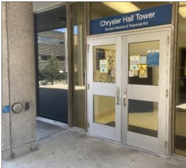
Accessible entrance to CHT, located on the north side.

The north entrance to CHT is equipped with actuators. An elevator off the lobby can provide access to the lower level of CHN. There is also a crosswalk on the second floor connecting CHT to CHN and CHS. There are ramps on the east and west sides of CHT that provide access to this entrance.