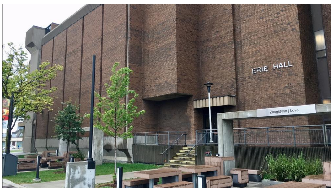
Outside view of Erie Hall, east side entrance.