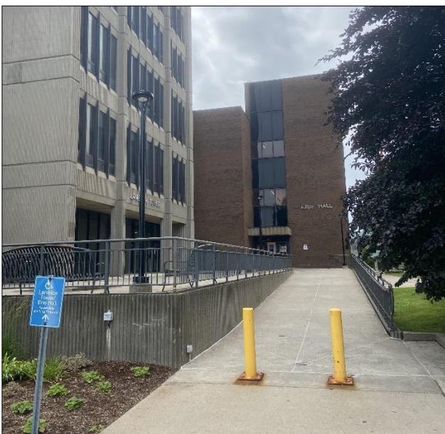
An accessible walkway (ramp) leads to the accessible entrance of Erie Hall (brown building above) and an accessible entrance to Lambton Tower (grey building above).

Note: There is no elevator in Erie Hall but Lambton Tower has an elevator. Both buildings are connected on floors 1-3. See notes under the "Elevator" heading below.