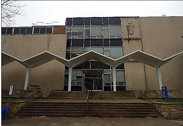
Main entrance to Essex Hall