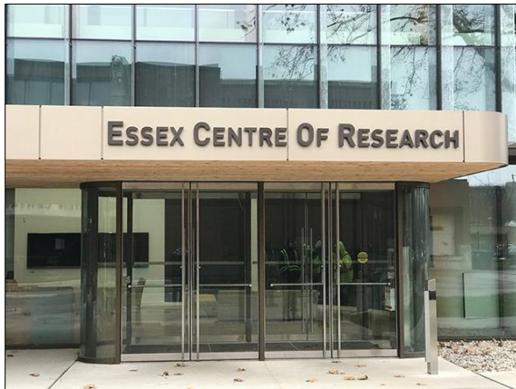
Essex Centre of Research (CORE) accessible entrance. The elevator inside provides access to Essex Hall

The Essex Centre of Research (also known as CORE) has an accessible entrance and is connected to Essex Hall on the north side. There is an elevator in the CORE lobby that provides access to all four levels of Essex Hall.