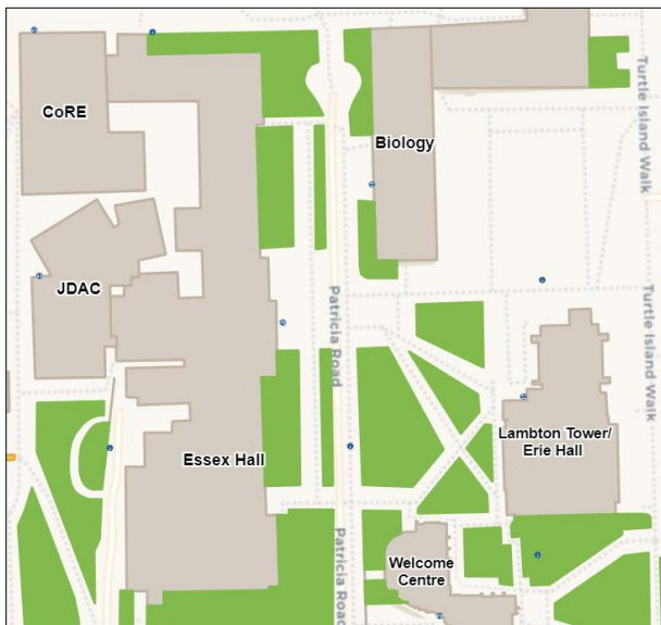
Map view of Essex Hall and surrounding buildings.

Note: Essex Hall has double doors (fire doors and smoke doors) throughout the hallways for fire safety purposes. The double doors do not have an automatic door openers.