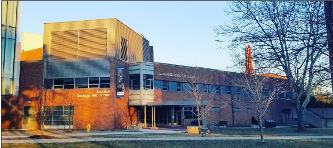
Exterior view of Jackman Dramatic Arts Centre