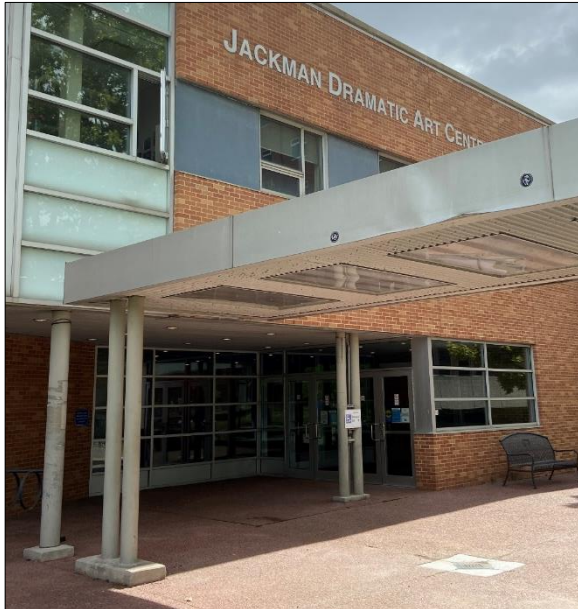
Main entrance to the Jackman Dramatic Arts Centre equipped with actuators.

The main entrance is accessible and equipped with an actuator. It is located on the west side of the building facing the residence quad. Please note that the actuator is on the interior of the pole in front of the doors.