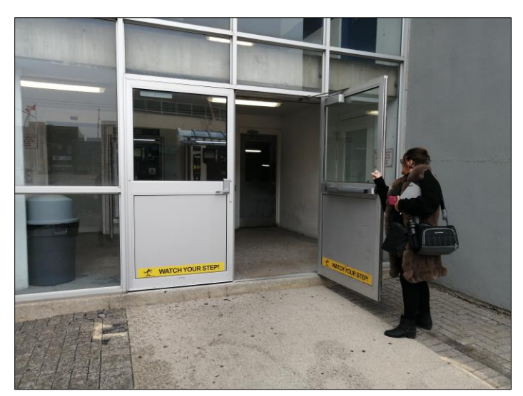
Dougall Avenue Entrance

Dougall Ave. entrance is not accessible. There is a double set of doors with no actuator and a steep step to access the vestibule on the first floor where the payment kiosk is located.