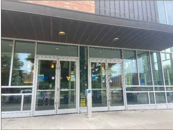
Main entrance at Toldo Health Education Centre.

An accessible main entrance is available on the northwest side of the building facing Fanchette Street. This entrance is equipped with actuators and is at ground level.