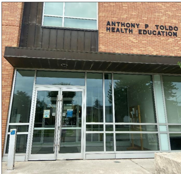
Accessible entrance on east side of the building.

An accessible entrance is available on the east side of the building at the corner of Fanchette Street and California Avenue. This entrance is equipped with actuators and is at ground level.