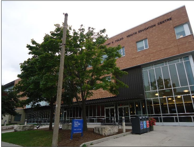
Anthony P. Toldo Health Education Centre.