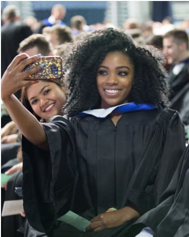
CONVOCATION FALL 2018