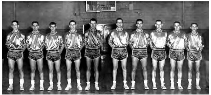
1958/1959 Lancers Basketball team