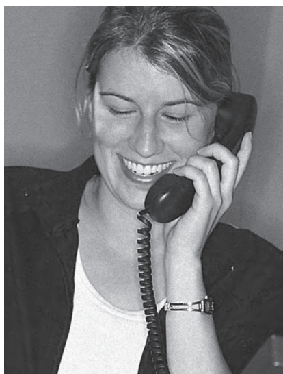
University of Windsor students make thousands of calls to potential donors each fall.