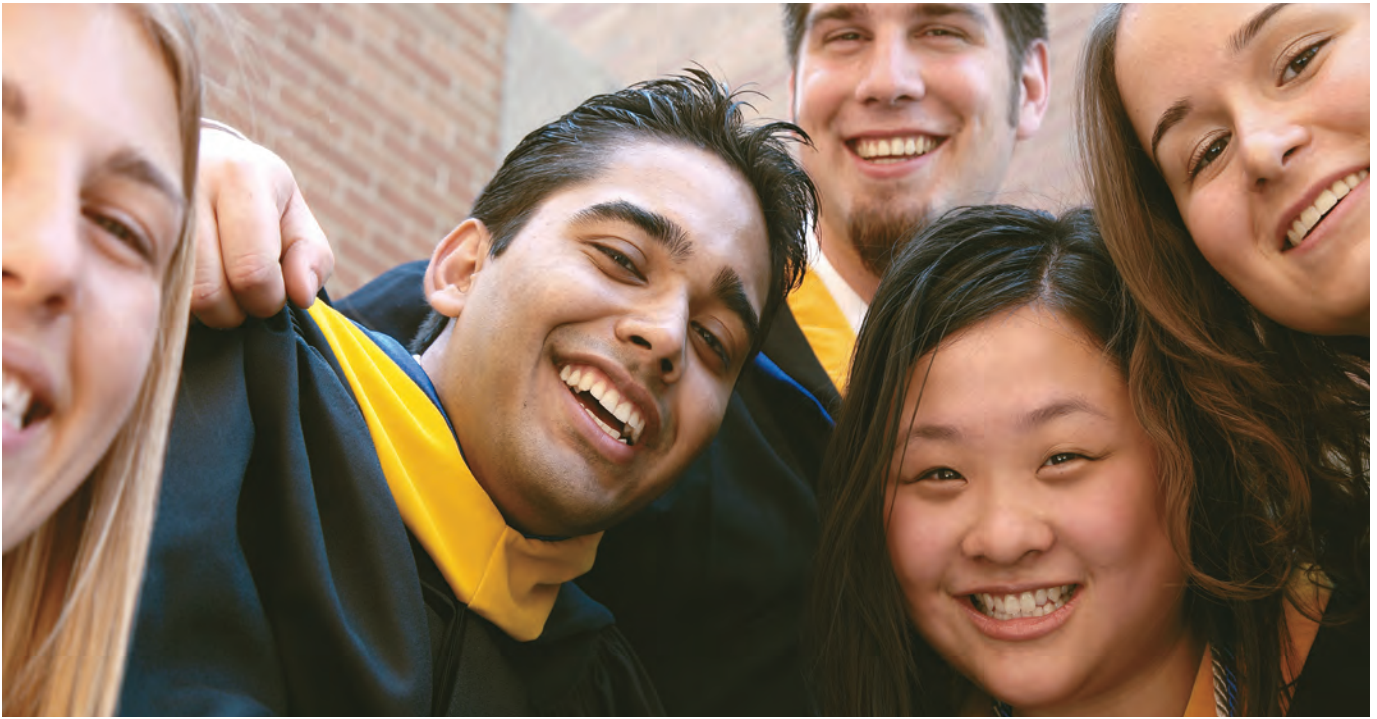
The Annual Giving Program has raised millions of dollars since its inception.