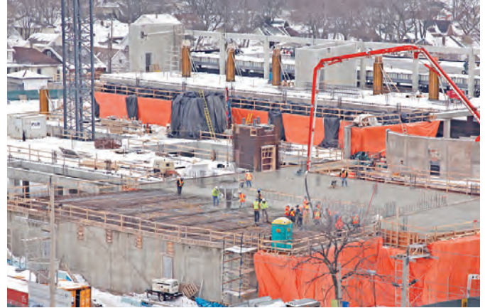
Construction on the Centre for Engineering Innovation is on track with Phase I slated for spring 2011 completion.

Much in the same way medical interns are educated in teaching hospitals, students in the University's Centre for Engineering Innovation (CEI) will have the unique experience of learning from the very building in which they'll study.