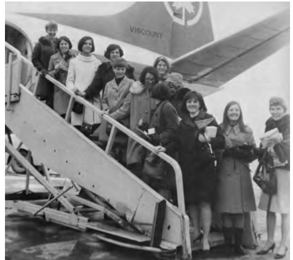
Women's Championship team - 1966/67

Today, the Lancers continue to strive towards success and excellence with a diligence that has been passed down from the generations before them.