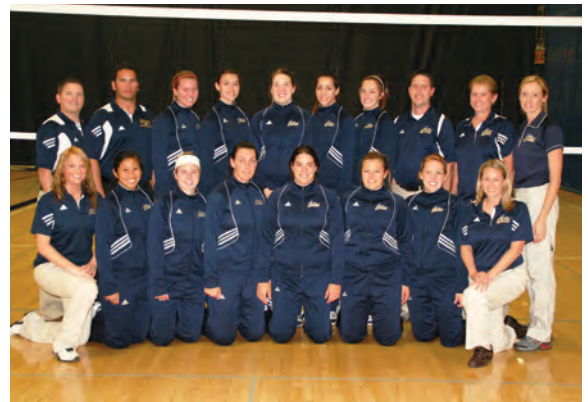
Lancer Women's team - 2010/11